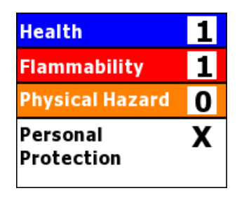
HMIS RATINGS (0-4)